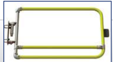
SINGLE EU GATE - GALVANISED SGEU600GV