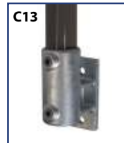
RAILING VERTICAL SIDE SUPPORT