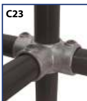
SIDE OUTLET TEE 45°