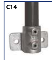
RAILING HORIZONTAL SIDE SUPPORT