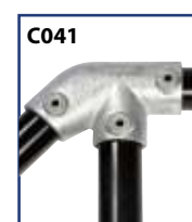
LEVEL TO SLOPING DOWN TEE 30° TO 45°