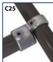
SHORT TEE SWIVEL