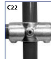
TWO SOCKET CROSS