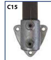
SIDE PALM FIXING