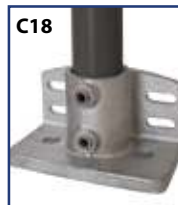
BASE FLANGE WITH INTEGRATED BOARD