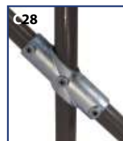
ADJUSTABLE 2 SOCKET CROSS 30° TO 45°