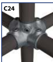
4 WAY CROSS + CENTRAL TUBE