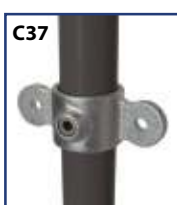
DOUBLE MALE SWIVEL