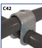
CLAMP ON CROSSOVER