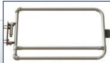
SINGLE EU GATE - GALVANISED SGEU600GV