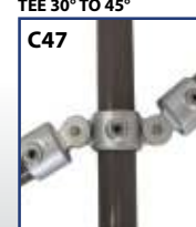
DOUBLE SWIVEL COMBINATION