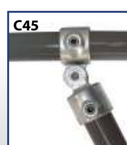
SINGLE SWIVEL COMBINATION