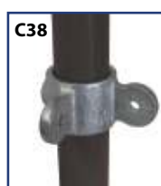
CORNER MALE SWIVEL 90°