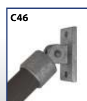
BASE SWIVEL COMBINATION