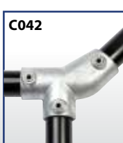
LEVEL TO SLOPING UP TEE 30° TO 45°