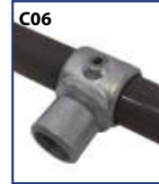
INTERNAL T JOINT