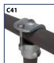
CLAMP ON TEE

TYPE G20 G25 G32 G40 G50 G25-32 G25-40 G32-40