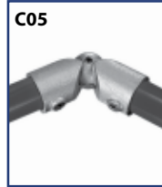
VARIABLE ELBOW 15° TO 60°