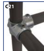
CORNER C/W THROUGH TUBE