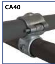
ADD ON CROSSOVER 90°