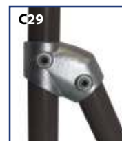
ADJUSTABLE SHORT TEE 30° TO 60°