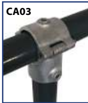
ADD ON SHORT TEE