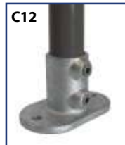
RAILING BASE FLANGE