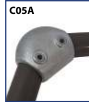
VARIABLE ELBOW 11° TO 30°